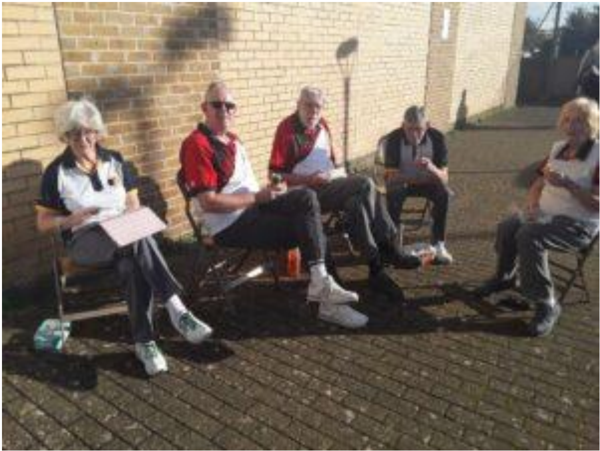
The "B's" Sunning themselves at Westergate 12-Nov-2022!